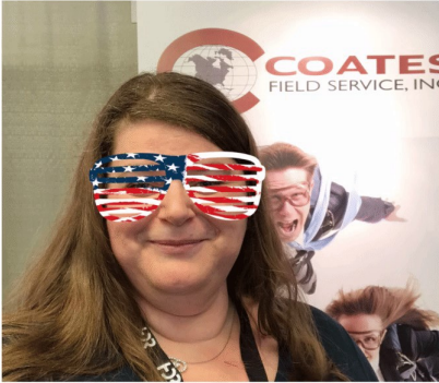
2019 IRWA Portland, OR