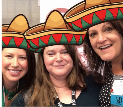
2019 IRWA Portland, OR