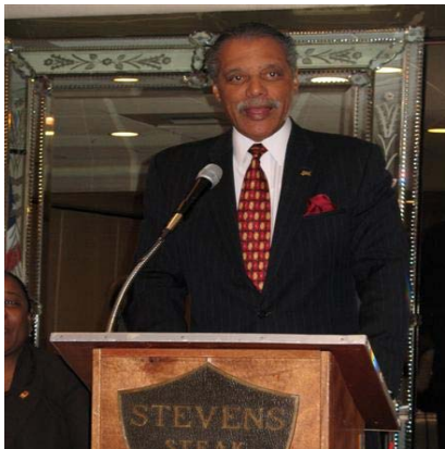
Councilman Bernard Parks, Los Angeles City Council