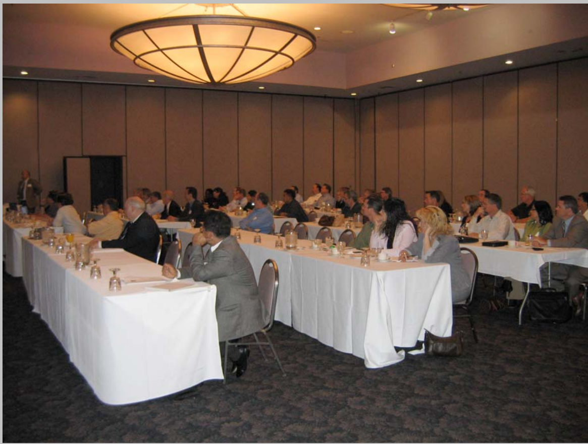
IRWA Chapter 1 Annual Fall Seminar taken on October 23, 2007 at the Quiet Cannon Montebello